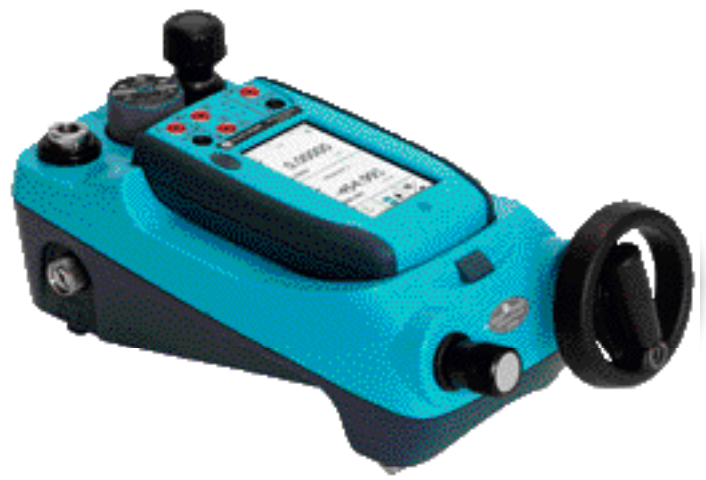
Re-rangeable pressure measurement and generation from 25 mbar (10 inH 2 O) to 1000 bar (15000 psi)