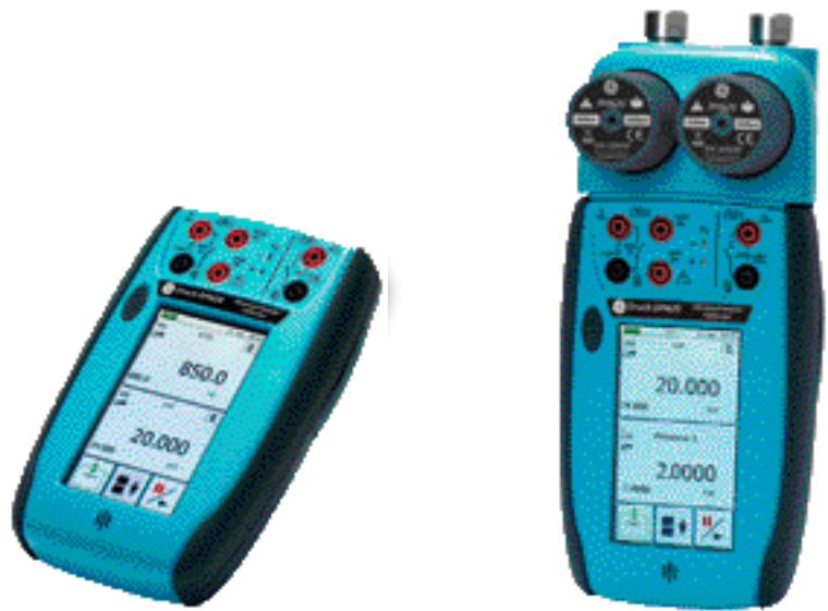
Measure and source mA, mV, V, ohms, frequency, RTD's and thermocouples.

The simple yet sophisticated design and concept combines, for the first time, an advanced electrical calibrator with state-of-the-art pressure measurement and generation, so that there is no longer any need to compromise one measurand capability in favour of another.